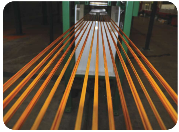
Fig. 1 — Continuous carbon fiber processing in a series of thermal steps; the process is engineered to apply heating and cooling to the most minimal load possible without need for material containment.

Careful consideration of raw material forms and process steps can have a big impact on the range of processing options available for later thermal processing methods.