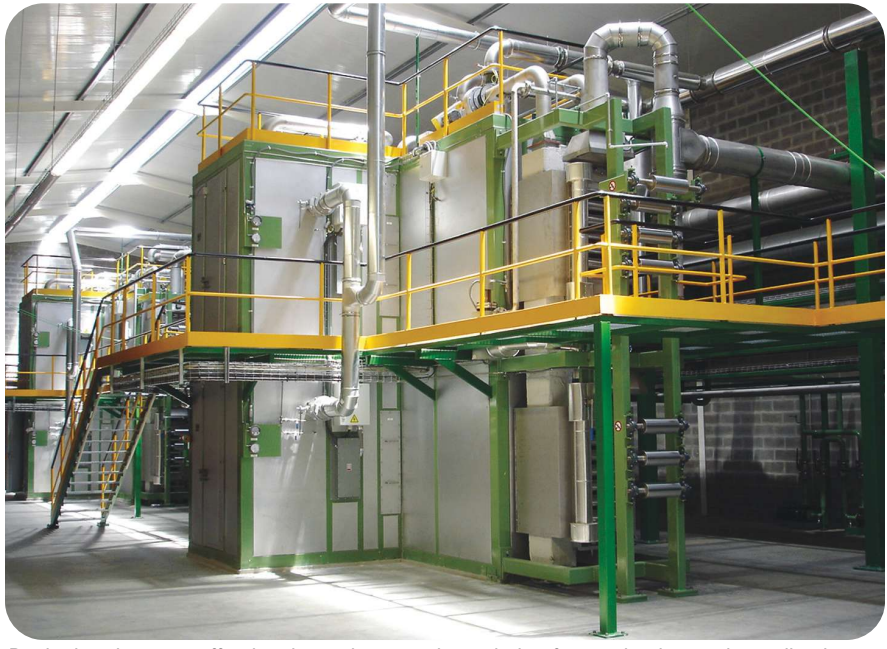
Designing the most effective thermal processing solution for production scale applications must include early consideration for energy efficiency, product quality, and throughput.

Scaling thermal processes is rarely a simple matter of linear extrapolation. At experimental rates, the conversion rate of many solid-solid and solid-gas reactions is primarily a function of the size of the reactants, and the level of mixing. As the reaction is scaled to larger sizes, the ability to heat or cool the mass of material and the ability to introduce or remove gasses from the solids plays an increasingly important role in reaction efficiency, often to the point of controlling the conversion rate.