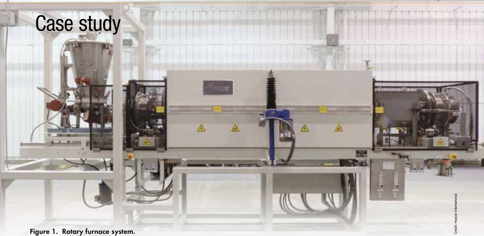
Figure 1. Rotary furnace system.