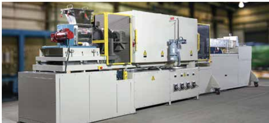
Figure 4. Mesh belt/rotary thermal combination system designed for a national laboratory with space constraints.

To meet all required design aspects, initially it seemed that the laboratory required two separate furnaces. Harper first considered a traditional rotary furnace and a traditional mesh belt