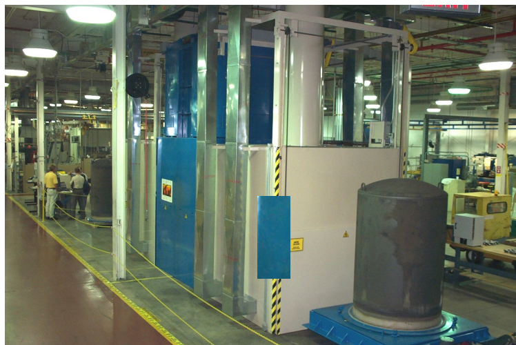
Turbine Blade Coating System

The Harper elevator kiln includes significant design enhancements over previous elevator systems. These include variable mass flow controlled gas flow into the retort, oxygen and water vapor sensing systems, additional heating elements and control zones for exacting temperature uniformity ( \pm 5^{\circ}\text{C} ), and isolated cooling chambers.