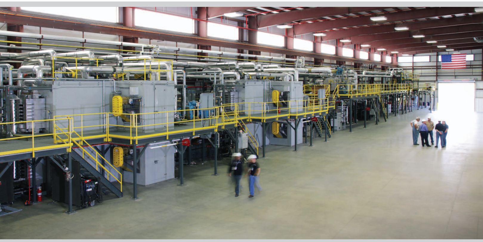
Oak Ridge National Laboratory's Carbon Fiber Technology Facility, a fully integrated line provided by Harper International